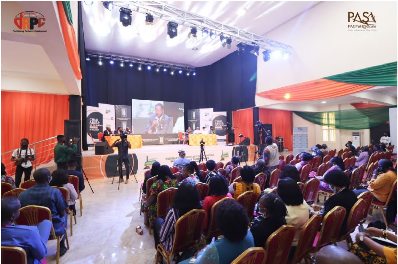
Cross section of panel session on "Sustaining Routine Immunization Financing Beyond the Context of COVID-19: Opportunities & Challenges" in the 2022 PAN Conference held on 20th January 2022 in Uyo, Akwa Ibom State

PACFaH@Scale supported 2022 PAN scientific conference held in Uyo Akwa Ibom state. PACFaH@Scale also worked with PAN to host a policy dialogue during the scientific conference. The session, titled "Sustaining Routine Immunization Financing Beyond the Context of COVID-19: Opportunities and Challenges," brought together policymakers and practitioners to discuss the milestones, challenges, and opportunities of routine immunization