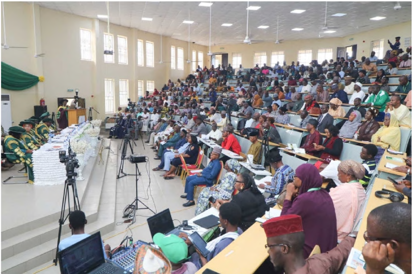
Cross section of participants at the 41st Inaugural Lecture held in the University of Abuja on 1st June 2023