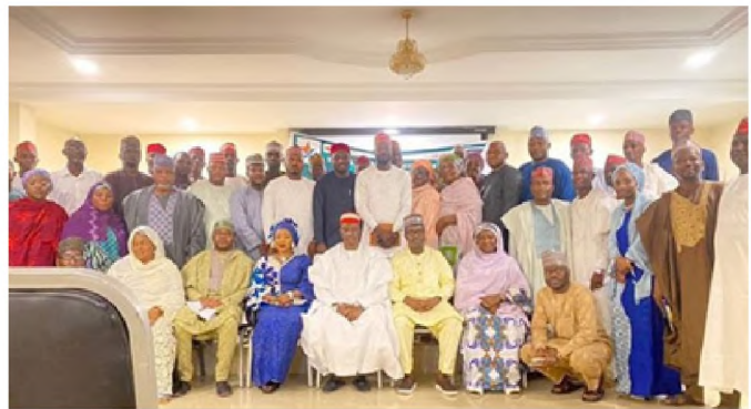
Group photograph of the participants of the Policy Dialogue - 10th May 2023